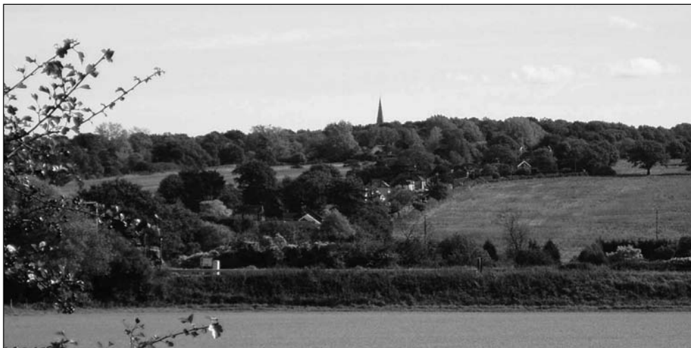
Private Road from A414

Continuing down Private Road, for 600 metres, as far as Butts Way.