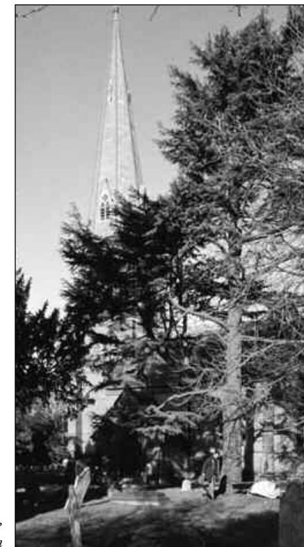
St. Michael and All Angels, the church on the common

At Goat Hall Lane turn left and after 250 metres turn right into Horse and Groom Lane which takes you back to your starting point, The Horse and Groom public house.