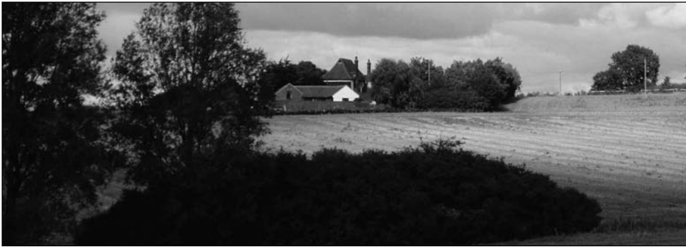
Lodge Farm from the south