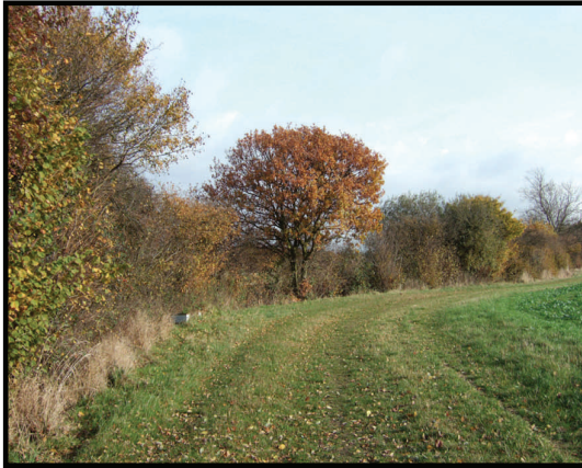
FP54 heading east towards Grove Wood - November 2007

In the winter, watch out for visiting thrushes from Scandinavia in the form of Redwings and Fieldfares on the pastures. On sunny spring days, Skylarks may be heard singing from above the field. They are however notoriously difficult to