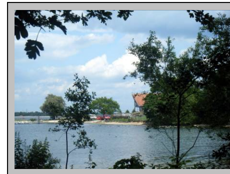
The Fishing Lodge

Other buildings demolished were Giffords Farm, Pynnings Farm and the Hamlet of Peadowns