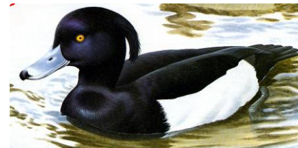
A Male Tufted Duck

Hanningfield Reservoir Nature Reserve gained SSSI status in 1996 because of its populations of Gadwell, Pochard, Shoveler, Teal, Tufted Duck and Shelduck