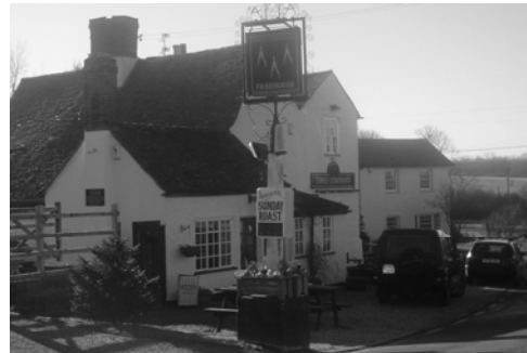
The Three Compasses

A further 200 metres along Mill Lane turn right onto Stock FP17 which takes you 400 metres east across the playing fields to