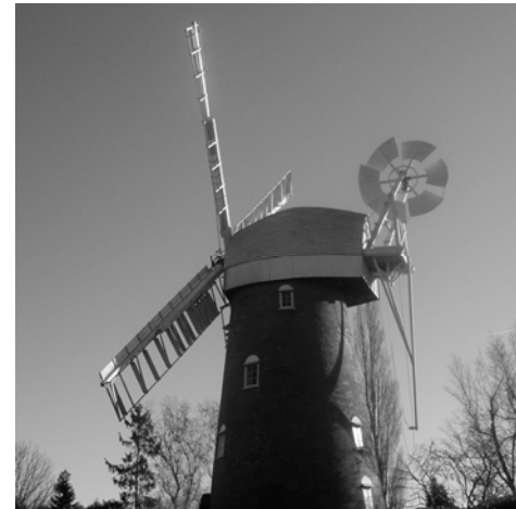
Stock Tower Mill

Downham Road. Turn right onto Downham Road, Leatherbottle Hill, and walk over the hill for 300 metres past the Old Ale House, a thatched cottage, on your right until you come to Seamans Lane (Stock FP57 ) on your left. Seamans Lane is now only a footpath as the through-route to the Old Southend Road was cut off when Hanningfield Reservoir was constructed. You will get glimpses of the reservoir on your right as you walk down Seamans Lane.