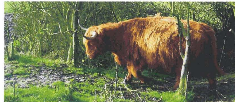
Highland Cattle at Fristling Hall

From the car park take FP47 west for 100m, turn left onto BR79 and after 50m turn right onto BR80 which takes you west, down the edge of The Common. After 700m, just before the bridleway comes out onto Margaretting Road, turn left onto FP46 . At the parish boundary join Chelmsford FP55 and continue until you reach the A12 boundary fence. Turn right and join Margaretting Road up some steps on the north-east side of the bridge over the A12. Cross the A12 and turn left onto Chelmsford BR46 which takes you south-east along the A12 boundary for 200m, then turn south-west into a green lane. After 600m you cross a stream on the parish boundary and continue straight ahead on Margaretting BR43 past Crondon House, crossing the approach track to Crondon Hall Farm and after 1km you reach Swan Lane. Turn left onto Swan Lane and after 450m you come to a sharp turn left. Keep straight ahead here joining Margaretting BR40 . After 200m you come to the junction with Margaretting FP36 and FP11 . Turn left onto Margaretting FP11 and follow the field crossing south-south-west for 300m to Fristling Hall. Cross the farm approach road and continue south on Margaretting FP11 . A stile takes you south for 100m between two railings to another stile where the path continues across a field where you may encounter some highland cattle.