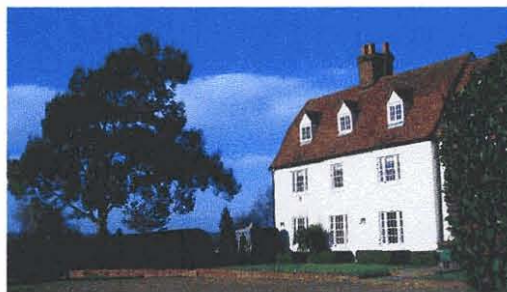
Impey Hall – Grade II Listed, 17 th century

Turn right onto School Lane and walk down to Stock Road where the old village school stands. Turn left up Stock Road past the Twedye Almshouse, cross Stock Road to All Saints' Church and walk through the churchyard then east on Stock FP28 for 300m to the junction with Stock FP29 . Turn left onto Stock FP29 and walk north for 200m to Our Lady and St. Joseph's Church at Mill Road. Turn right onto Mill Road and after 150m turn left onto Common Lane which takes you 300m north up the lane and across Stock Common past the cricket pavilion to Common Road. Turn left onto Common Road past the Bakers Arms PH where you come out onto Stock Road. Turn right and walk on the pavement for 500m to Stock Boarding Kennels, cross Stock Road at the kennels and join Stock FP14 , take the left turning and follow Stock FP14 round the western edge of Forest Wood for 1.4km.