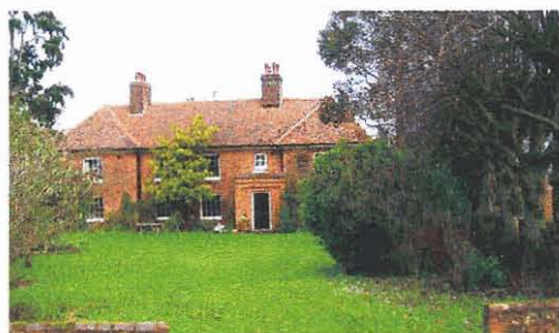
Ramsey Tyrells – Grade II Listed, 16 th century, timber framed house with a late 18 th century red brick front

The farm track past Impey Hall is part of an ancient track which once linked Stock via Mountnessing to the Essex Way at Greensted taking a more southerly route than the modern St Peter's Way.