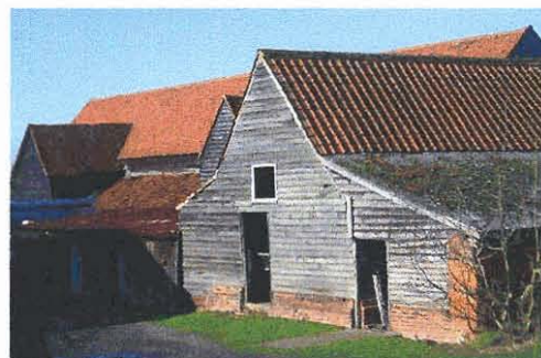
Barns at Fristling Hall – The Great Barn is Grade II Listed, late 16 th century

In December 1940 a German high explosive parachute bomb landed in the churchyard, causing immense damage to Church and surrounding buildings, hundreds of windows were broken throughout the village