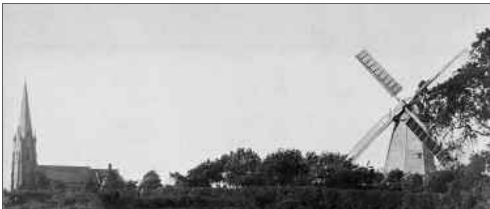
View of St. Michael & All Angels Church and Upper Mill from The Common, c.1920.

Return to your starting point at the Keene Hall.