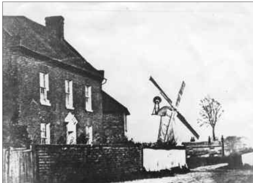
View of Lower Mill from Brick House, The Street, c.1890.

From Marvens Pond proceed south down The Common, cross the Wood Farm approach road and the car park and cross Stock Road opposite Glebe Farm. Follow FP50 , which starts along Glebe Farm approach road to the pond where FP50 enters the field and continues northeast to Lower Green at Ponds Farm.