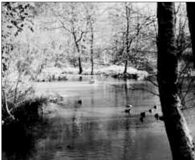
Wintertime at Marvens Pond, 2004.

Cross bridleway 79 and continue west down The Common to the south of London Hill until you meet bridleway 80 . Good views from here looking southwest over Wood Farm fields to Crondon Hall. Return up bridleway 80 to bridleway 79 and turn south, passing Farthings and Rous Cottage.