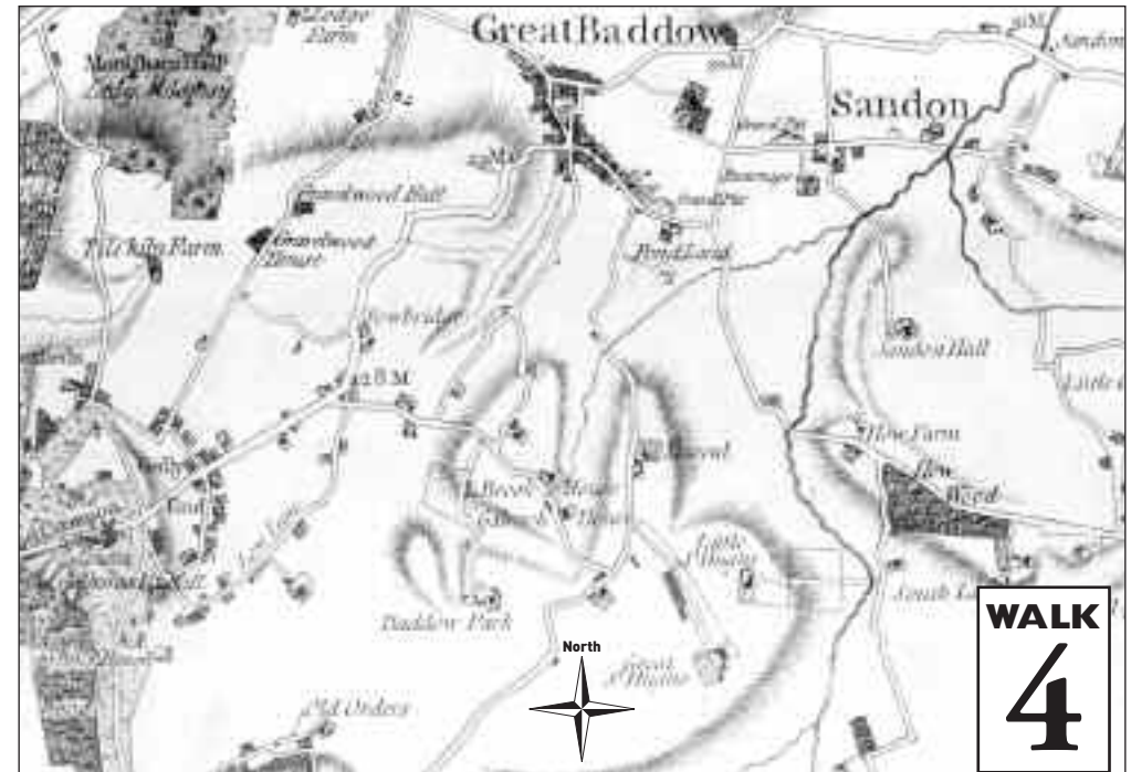
The Chapman & André map of Essex, 1777

Follow FP30 along the field hedge down to Galleywood Brook then continue on the cross-field path to Vicarage Lane. If your eyesight is good you should be able to see the white-topped sighting post. Turn left on Vicarage Lane and then right into Brook Lane passing Mapletree Cottage (still called Willow Cottage on some maps). 350 metres along Brook Lane turn right onto BR29. This ancient