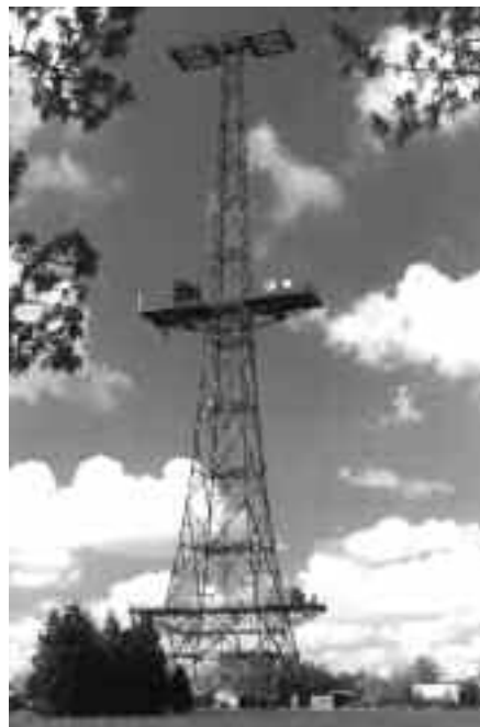
Marconi CH Transmitter Tower

The bridleway rejoins Vicarage Lane at Lawn Cemetery which is within the Civil Parish of Galleywood but administered by Great Baddow Parish Council. Opposite the cemetery is the old Marconi Radar Tower which acts as a landmark for walks on the south-east side of Galleywood.