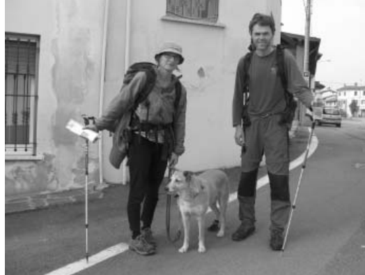
In Orio Litta, Lombardy. The mayor of the town took this photograph

Ask anyone who has set off on a long adventure and they will almost certainly say the most difficult part of all was starting. The mere act of closing the garden gate behind you feels so impossibly hard yet within seconds the most affirming. Yet with a carefully selected and very small bag of belongings, it is difficult not to giggle at the realisation that you have just escaped the velvet rut and toddled off down the road to something more exciting. This is the essence of any pilgrimage – the opportunity to experience the highs and lows of a journey and adventure through a foreign land, to