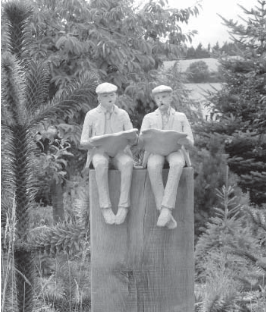
'Sorting out the economy', a wood carving by Simon Conoly on the sculpture trail at Mount Pleasant. Below (we'd have loved to caption it in cod Latin) Clive as charioteer, very close to the line of the Roman road from Condote (Northwich) to Deva (Chester).

put into service in 1875 and known as one of the seven wonders of the waterways, lifts boats between rivers Weaver and Trent and Mersey Canal. We enjoyed the boat lift and the canal trip that followed.